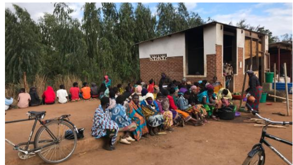
Employees lining up to receive pay

We currently have 32 full-time employees and at times hire an additional 100 part-time workers. Their ability to earn a salary and provide for their families is transformative, building self-reliance and self-esteem.