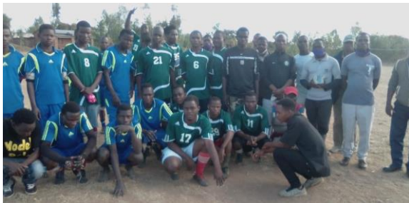
Employee initiated men's soccer team

Another exciting development this year was the formation of an employee operated village sports league. The employees formed a soccer team for the men and a netball team for the ladies.