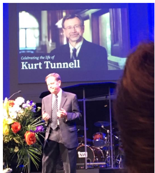
I was honored to deliver a Eulogy