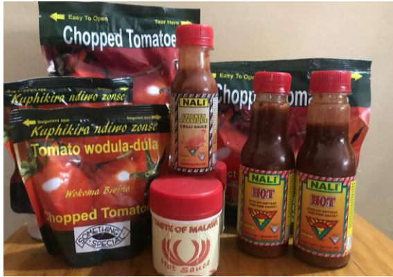
Our vegetables are used in these products

Commercial tomato farming is not easy. As a result of valuable lessons learned, we are in the process of redesigning our entire approach to tomato production from seed to harvest. We are studying and seeking outside expertise regarding seed selection/propagation, fertilizer/pest control protocols, long-term soil health, crop rotation and watering techniques.