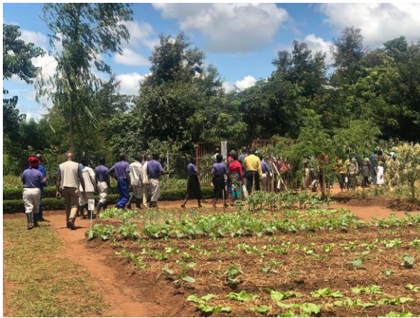
Guided tour during Grand Opening