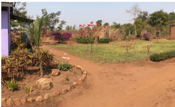
Our entrance gardens

It is an important objective for us to improve the lives of our employees through vocational and life skills training. To support our training objectives, last year we began to develop a training/demonstration plot. We transformed the entrance area (about 2 acres) of our farm into a demonstration showcase. The demonstration area highlights Foundations for Farming techniques and provides a training facility for the local village. We designed the demonstration area with a few unique characteristics. First, we are providing a park-like environment with grass-covered paths, including flowers and shrubs throughout.