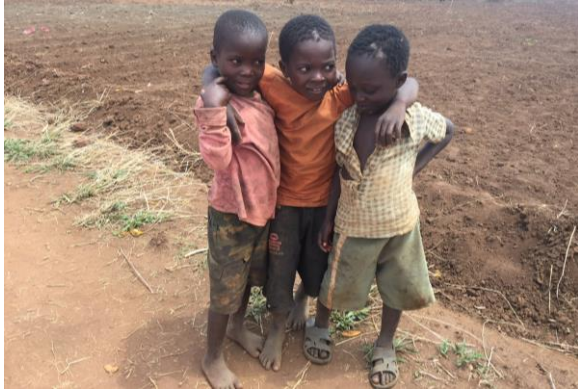
Three precious Namikango children

We could fill twenty reports with our experiences over the past 12 years visiting and living in Malawi. The more we experience and understand the plight of villagers in Namikango, the more our hearts are determined to stay the course. We are blessed to be a small part of what God is doing to bring hope and redemption to Malawians.