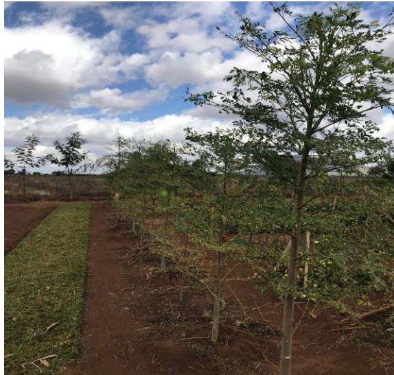
Moringa super food/vitamin in Model Village