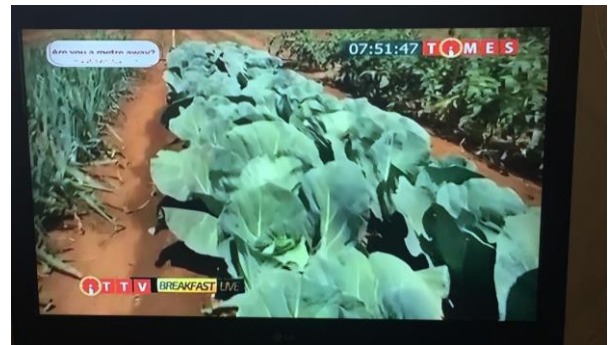
TV interview with our farm manager