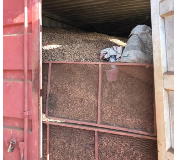
Storing unshelled ground nut seeds

Tomatoes and onions are our primary revenue source from our irrigated fields. Since our inception, we have sold a whopping 87 metric tons of tomatoes. So far this calendar year, we have sold 30 tons. The demand for our tomatoes continues to grow.