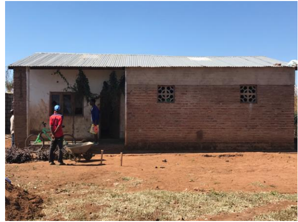
Sales office (before)

Three Malawi Talent Fund board members traveled to Malawi to attend the ceremony. They participated in the festivities, made presentations and spent time with our employees.