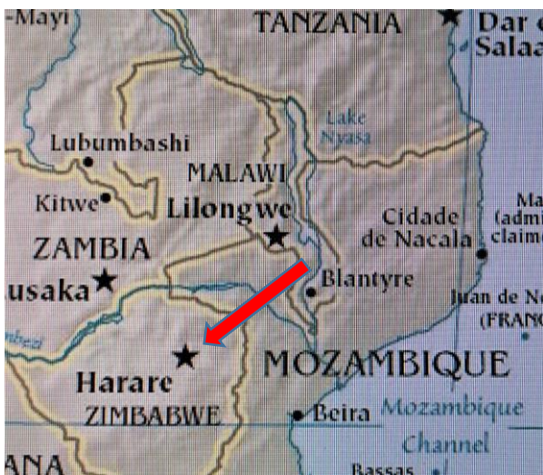
Road trip from Malawi to Zimbabwe