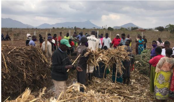
One of multiple village training programs

improve productivity and cost less to implement. We have discussed this method in detail in previous reports. We expanded our training this year to include over 130 local villagers, employees and even customers.