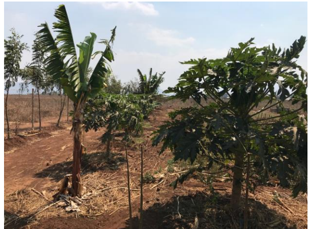
Banana and papaya trees in the Model Village

Secondly, as we introduced last year, we are well underway in creating the “model village.” We planted moringa, banana, orange, lemon and papaya trees to teach others how to provide a proper dietary balance for the entire family. Also, our model village includes various vegetables and spices. We are even in the process of constructing our model chicken house suitable for village life and introducing egg and meat production for protein.