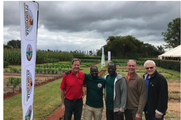
Foundation for Farming HQ in Harare

We received many good ideas and training suggestions for our outreach ministry. In addition, we discovered some new techniques and approaches to organic farming that we will implement in our production fields.