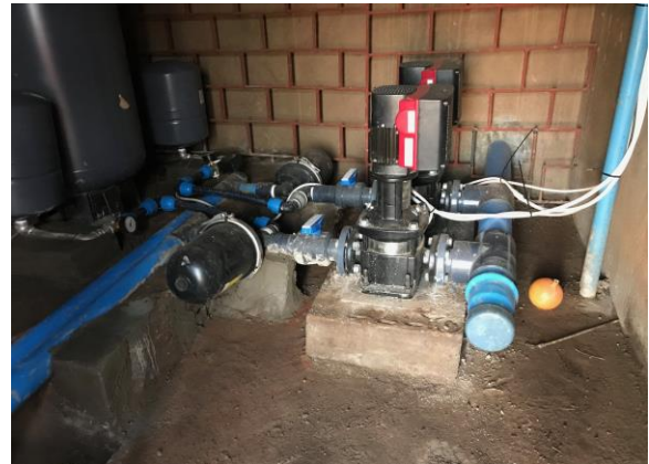
Dual surface solar pressure pumps

Our upgraded irrigation system will include surface solar-powered pressure pumps and an integrated electronic system to sense pressure and water levels within our 30,000-liter tank farm. We estimate throughput to be between 12 and 14 thousand liters an hour. All this water will enable us to provide drip irrigation simultaneously to nine production tomato fields and three vegetable plots. Our drip pipes and connectors were manufactured in Israel.