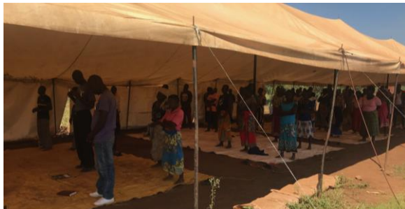
Monthly gospel outreach lunches

To that end, we have initiated a monthly gospel outreach on our property. The second Wednesday of each month, we sponsor a lunch-time event. Attendance is purely optional, and open to everyone working on that specific day. We provide a full lunch, then invite a local sister church pastor to speak. Many have accepted Christ as their savior. Our goal with all outreach events is to present the gospel then connect folks with a local sister church.