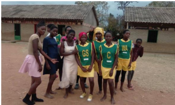
Employee initiated women's netball team

The local church also joined in the activities. We not only formed our teams but have encouraged the creation of other local teams to join the league. The more exciting news is what happens at halftime. One of our employees that attends one of our local sister churches presents the gospel message along with distributing gospel tracks.