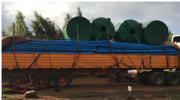
New tanks and 1.4 miles of piping

To greatly improve our vegetable production, we are making some major investments in new irrigation technology. We are increasing the number of irrigated tomato/vegetable plots by almost three-fold (8 acres to 21 acres) enabling longer crop rotation periods, reducing the spread of disease, all while improving soil health. To accommodate these extra plots, we are in the process of redesigning our irrigation delivery system and implementing drip irrigation. We are installing an additional 1.4 miles of underground pipe and adding a third borehole as an additional water source.