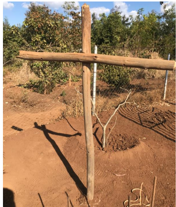
"Now then we are ambassadors for Christ..." 2 Corinthians 5:20

We are swimming upstream. Adhering to biblical standards makes it very difficult for a business to thrive in Malawi. But that is the only way God will honor our business. Our clients must see Christ in us. Our employees must see Christ in us. Please pray for us as we continue to maintain biblical standards.