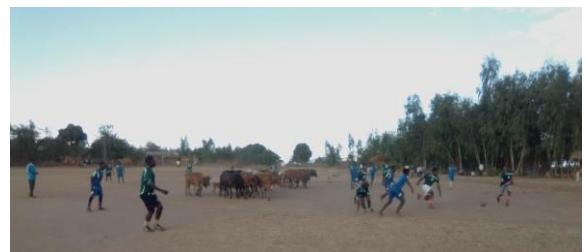
Sharing the soccer pitch with local cattle

There are times our teams have trouble finding a playing field. There have been occasions when we needed to share the field with other local activities.