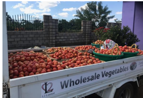
Our delivery truck loaded for delivery

Tomatoes and onions are our primary revenue source from our irrigated fields. Since our inception, we have sold a whopping 87 metric tons of tomatoes. So far this calendar year, we have sold 30 tons. The demand for our tomatoes continues to grow.