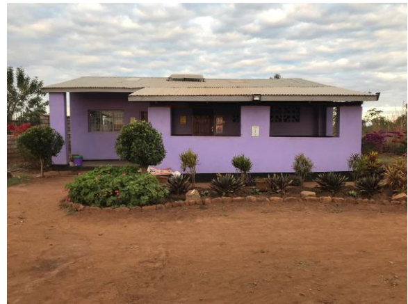
Sales office (after)

Three Malawi Talent Fund board members traveled to Malawi to attend the ceremony. They participated in the festivities, made presentations and spent time with our employees.