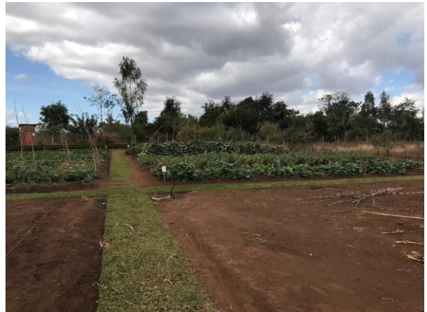
Vegetables and spices in the Model Village

When complete next year, our model village and demonstration plot will be a fully functional training/learning center suitable for youth retreats, training seminars and hands-on learning.