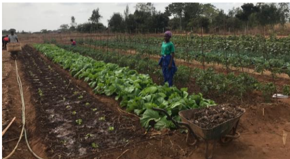
Research & development plot

Seed selection and growing protocols have been a challenge in our environment. Selection and availability of quality seeds and other inputs have been difficult. With the assistance of Farmers Organization Limited (FOL), we have established a research and development function to combat these obstacles. We have dedicated specific plots and employees to oversee this important implementation. FOL is supplying seed and the necessary fertilizers for live testing. Our goal is to test seeds and growing protocols prior to production implementation.