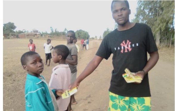
Distribution of gospel tracks

The local church also joined in the activities. We not only formed our teams but have encouraged the creation of other local teams to join the league. The more exciting news is what happens at halftime. One of our employees that attends one of our local sister churches presents the gospel message along with distributing gospel tracks.