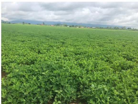
18 acres of ground nuts

We are currently harvesting and grading this season's ground nut seeds. We anticipate delivering 6 tons. Ground nuts are more difficult to harvest and process but generate higher revenues per kilo.